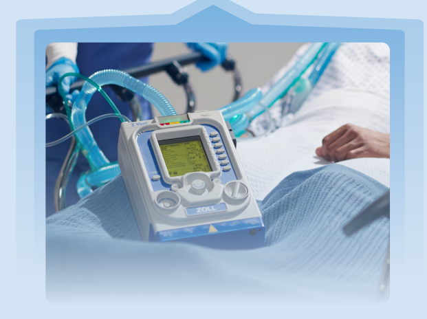
COMPREHENSIVE VENTILATION MODES